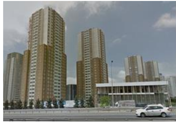
Figure 5. A view from Solar Kent