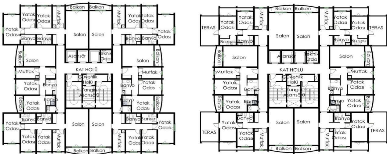
Figure 6. Floor plan of A Housing Block, 1th to 18th floors Figure7. Floor plan of A Housing Block, 19th to 30th floors

There are no panels or control systems that allow users to see the amount of energy they use in their own places by controlling the light, temperature and sunlight in their homes and to adjust their personal comfort levels within certain limits. PVC joinery used in windows are also high-energy and not ecologically mentioned before, this material also causes the volatile organic compound known as "vinyl chloride" to spread to the center. Although it is known that the settlement does not have a suitable area in terms of the ground, it is not known whether or not the carrier system has a high resistance in terms of earthquake. However, it is a positive undertaking to carry out the carrier system and static works under the consultancy of ITU Faculty of Civil Engineering.