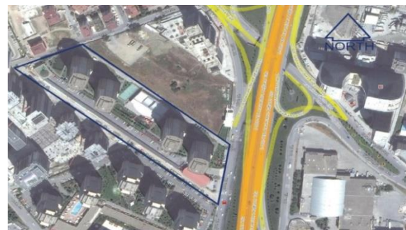
Figure 2. Regional location of Solar Kent