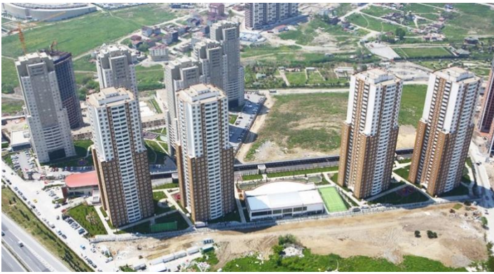
Figure 4. Air photo of Solar Kent